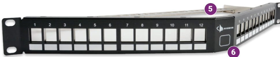
24-Port Angled Panel